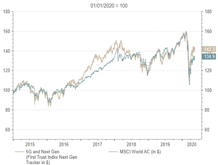
Theme 4: 5G and digital

For businesses, relocation and digitalisation are becoming a real priority.